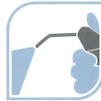
STEP 4: FLUSH WATERLINES WITH WATER