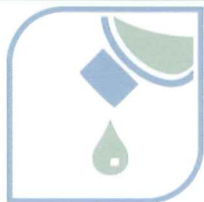
STEP 2: ADD MINT-A-KLEEN*