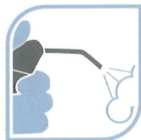
STEP 1: AIR PURGE WATERLINES